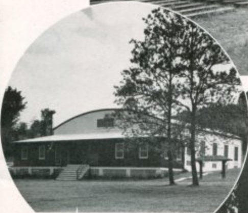
View from the Hillside